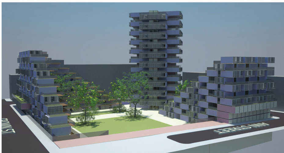
PERSPECTIVE IMAGES - NTS